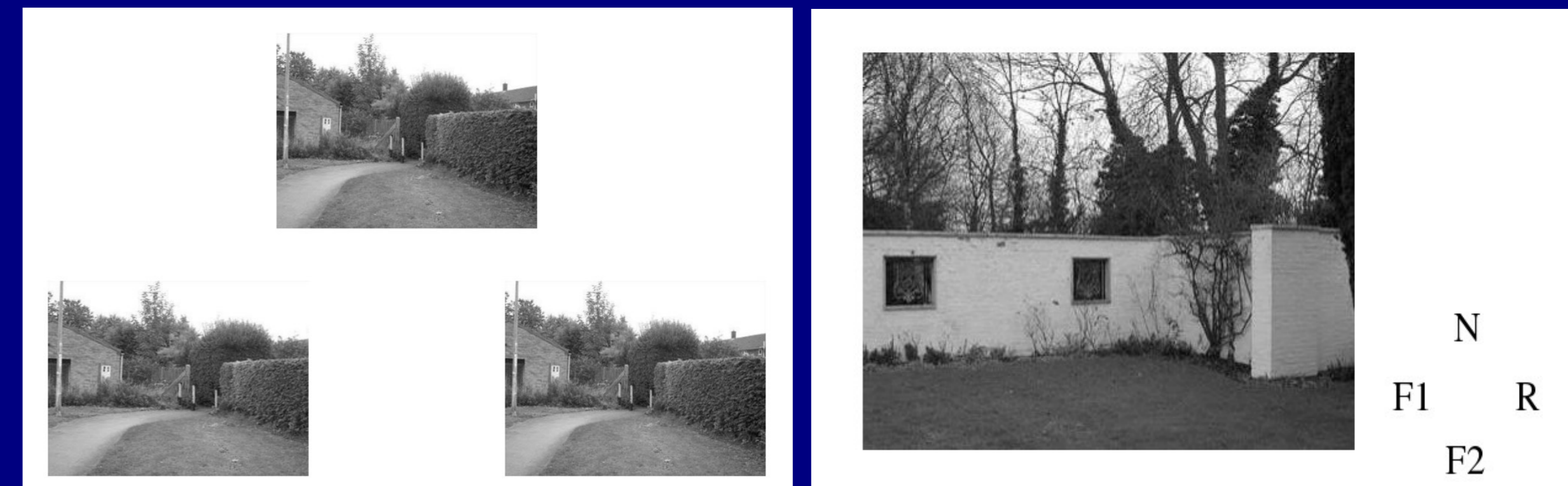
Fig.1 Example of Encoding (outside the scanner) and Retrieval (inside the scanner) image presentation

Objectives: Deja-vu (DV) is a transient state of incongruous familiarity feeling about present experience, occurring at least once in life in almost 80% of healthy individuals; it is also reported in patients with mesial temporal lobe epilepsy and psychiatric disorders (e.g., schizophrenia), in which it may represent a key symptom. Past neuroimaging studies, including our own, showed that structural changes in mesio-temporal and extratemporal structures may be associated with an increased tendency to experience DV, although it is unknown whether functional alterations within neural circuits underlying familiarity-based and recollection-based memory may be detected in people with frequent DV episodes. The present study aimed therefore to assess brain functional correlates of familiarity-based and recollection-based memory in healthy subjects with frequent DV episodes compared with healthy individuals without DV.