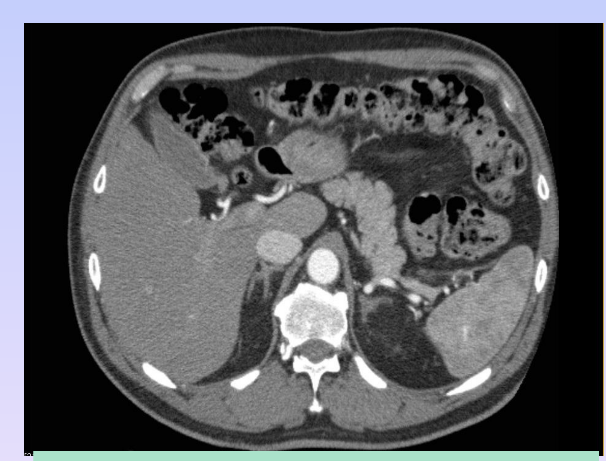
Fig 1. Abdominal CT scan with contrast

So our diagnosis was hypokalemic paralysis caused by primary hyperaldosteronism.