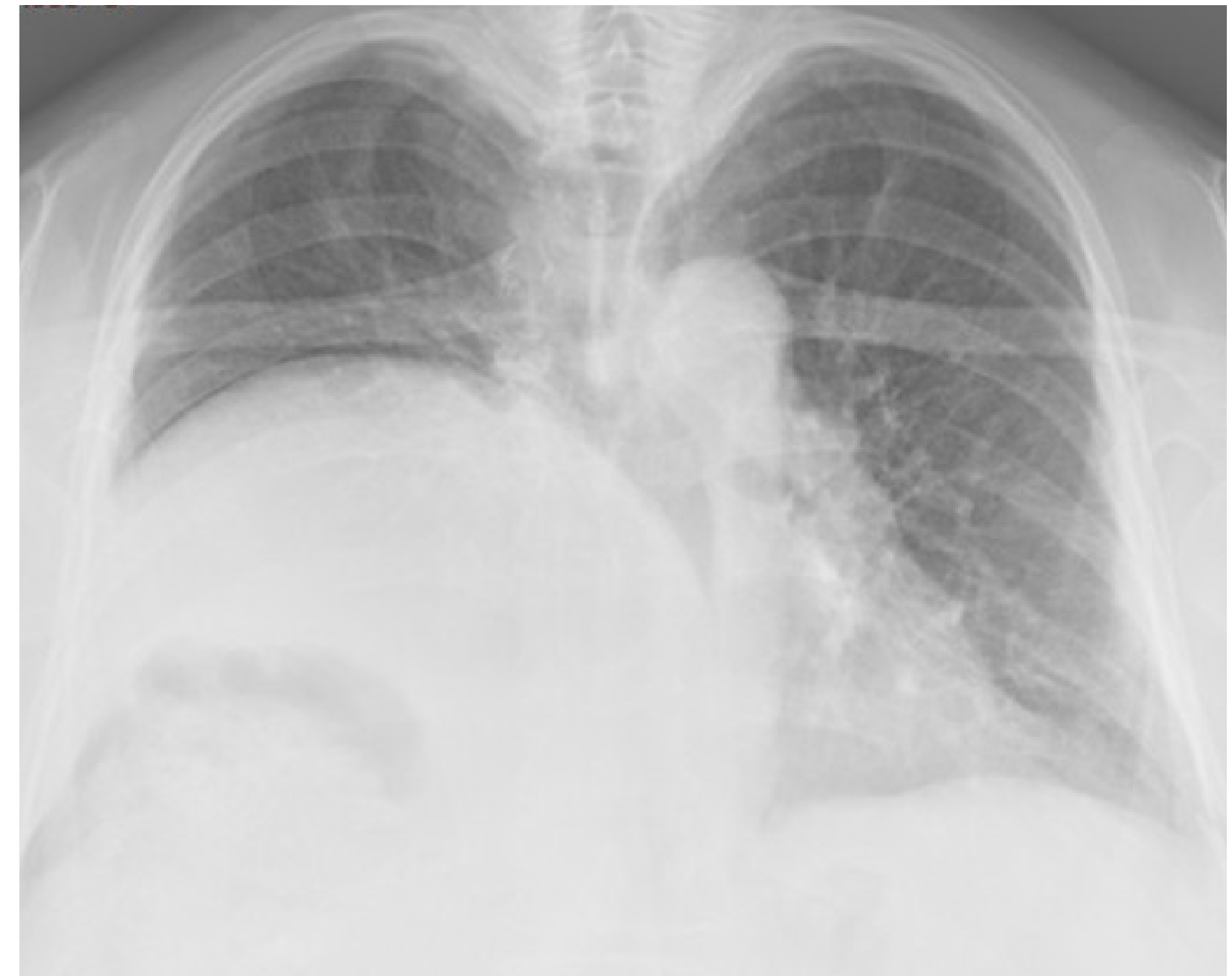
Right hemidiaphragm elevation in our patient

A chest X-ray revealed right hemidiaphragm elevation.