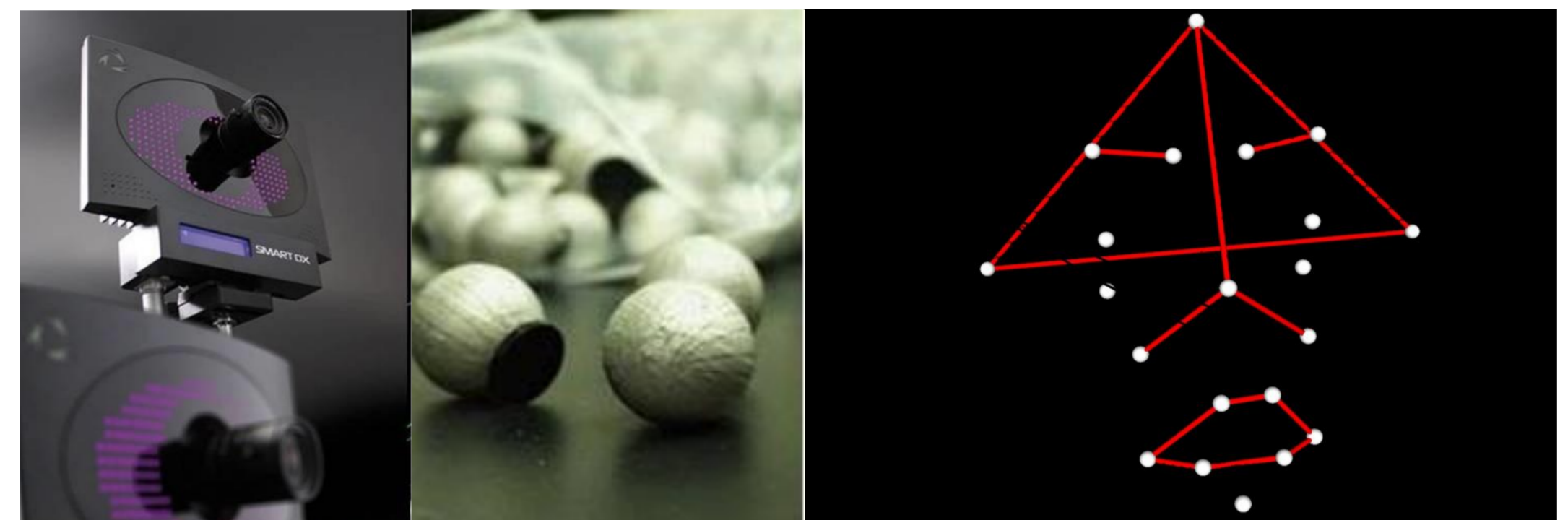
FIGURE 1. The 3D optoelectronic system (SMART motion system, BTS, Engineering, Milan, Italy) comprises three infrared cameras - sampling rate, 120 Hz (left panel) able to follow the displacement of 21 reflective markers (central panel) taped on the face of subjects (right panel).

RESULTS: Patients had reduced expressivity of all the six basic emotions in comparison to healthy controls - TABLE 2 . Patients also yielded worse scores than healthy controls in the Ekman global scores and for individual scores of disgust, sadness and fear- FIGURE 2 . Emotion recognition and expressivity deficits did not correlate each other or with clinical and demographic features.